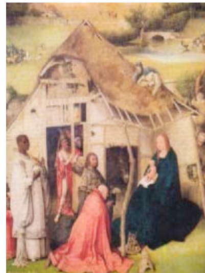
The picture was painted by Hieronymus Bosch in 1516. It is from a triptych called "The Adoration of the Magi".