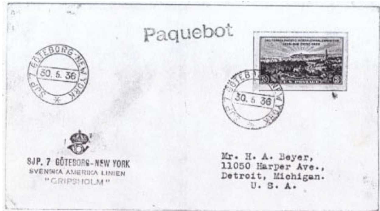
Figure 1. The Gripsholms

The rough seas and turbulent weather created a difficult problem for the packetboats. Piracy was the second difficult problem they had to overcome. Trade had now developed between France, England and Holland. The boats had to be on the alert for pirates from these actions. One ship, the "Speedy Post," was hijacked 5 times in 7 weeks. This was at the docks at Dover. Eventually these ships were outfitted with brass guns.