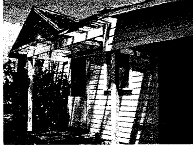
Left: Front of original Mitchell Ellington home facing North Tropical Trail. Right: Side view of home.