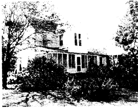
Sams House on Pine Island Conservation Area. Structure to right shows part of Sams House 1.

The Brevard County Historical Commission requested the Indian River Anthropological Society (IRAS) to conduct a preliminary survey of the area. The IRAS and Thomas Penders Associates, Titusville, conducted the study from Oct. 2003 through April 2004. In addition to the two historic Sams House