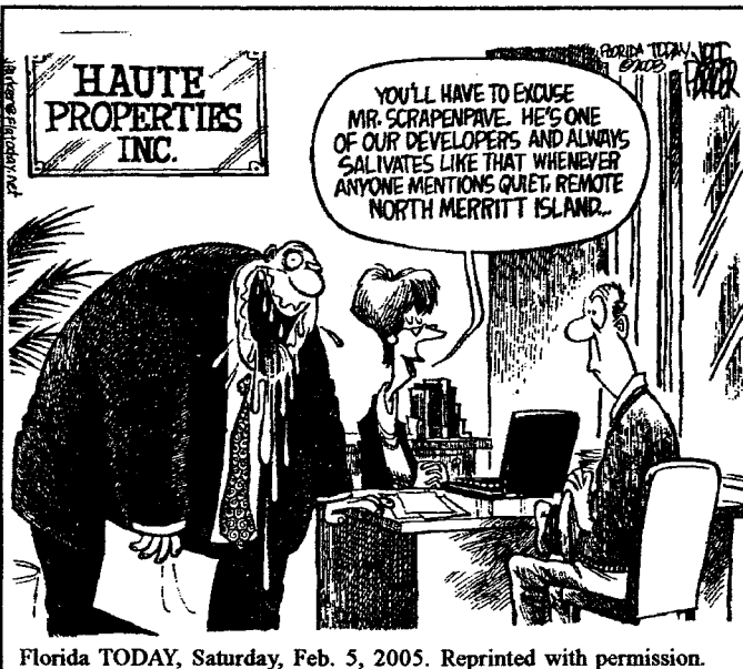
Florida TODAY, Saturday, Feb. 5, 2005. Reprinted with permission.