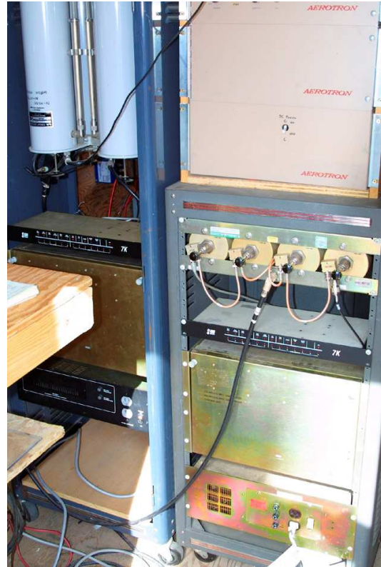
A peek into the Shack... the 195 is on the left. The 70CM machine is in the lower right and the upper right is the spare 2M machine.