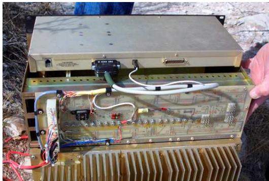
New Audio Cable

Here are a few pics of the 2M machine and the shack.