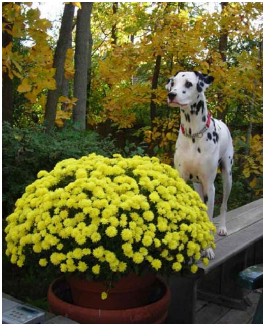
Gabe enjoying the Fall

Traditional harnesses can actually encourage dogs to pull harder because of the opposition reflex. That's the reflex that makes sled dogs do what they do. The Easy Walk Harness redirects the pressure through the front leash attachment. And, the patent pending martingale closure tightens slightly across the chest and shoulder blades when your dog attempts to pull forward. It sells for approx $22.