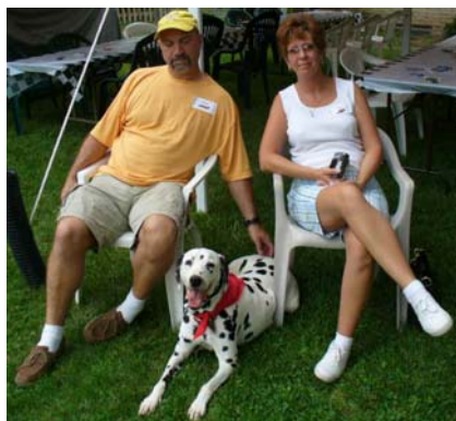
The Poole Family