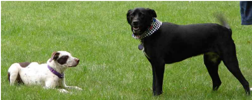
Grace asking her Mom if she can have the puppy