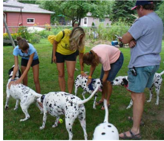
Meet and Greet