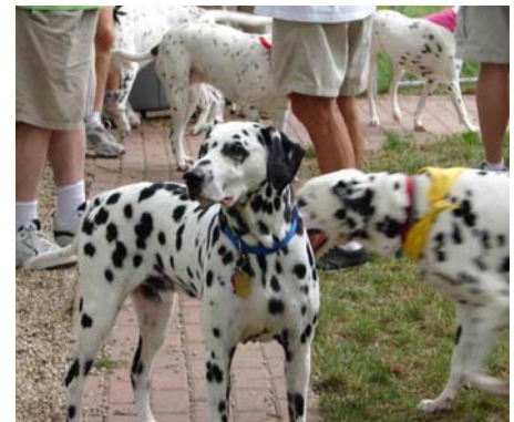
Mickey looking for Dad