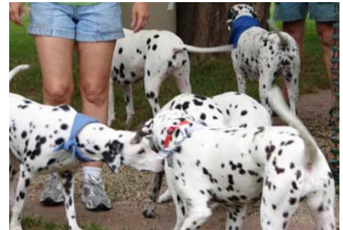
Lots of Spots