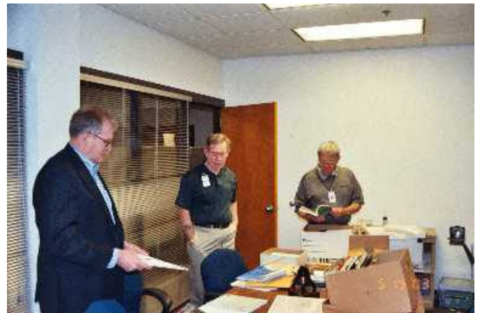
Going over material at a Chapter-history focused Chapter meeting (May 2003)