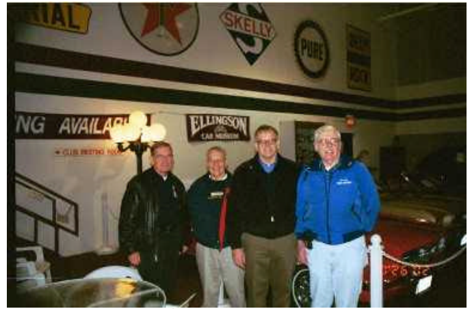
At the Ellingson Car Museum thinking about our lost youth (October 2002).