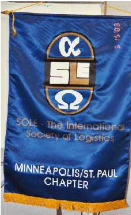
The Chapter Banner of our Chapter received after the Society's name change (2000).