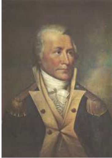
Brigadier General Thomas Sumter Painted by Rembrandt Peale, 1796.