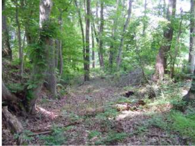
View along roadbed approaching campground from South Carolina.