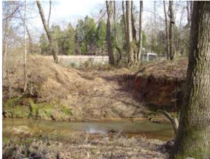
Embankment cut on Clems Branch. Possible historical road crossing. View south over creek to campground in the distance.

Today, the most convenient access to the campground is from the end of Camden Woods Drive. The old road probably extended along the base of the hillside and could have crossed Clems Branch at the only embankment cut that is evident today. That location is about 100 yards downstream of the precise state line crossing.