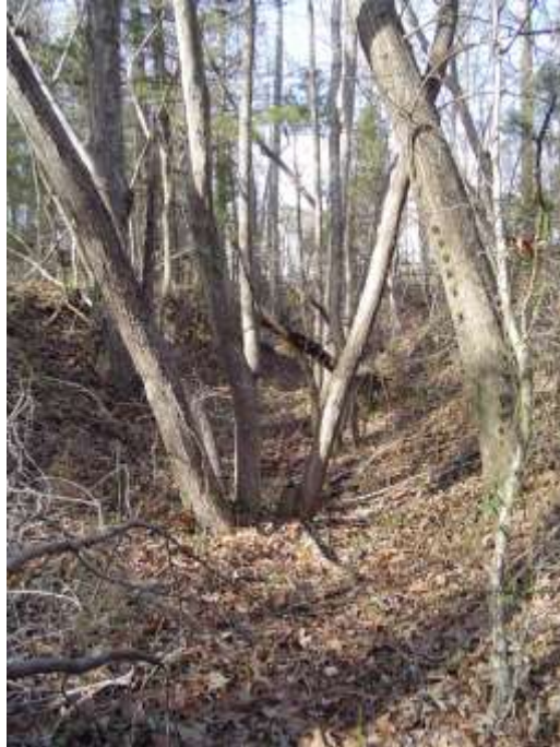
Probable road continuation in North Carolina. Partially obscured by trees in this view.

Beyond there, the old road is obliterated in the Providence Pointe housing development. Thomas Culp pointed out how the old road extended northward to the top of the long hill, connecting with Harrison United Methodist Church where it ran directly in front of the present-day sanctuary and graveyard.