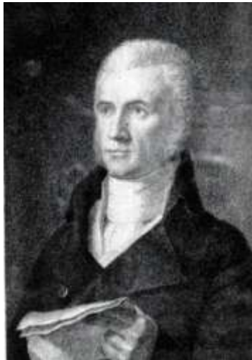
William Richardson Davie