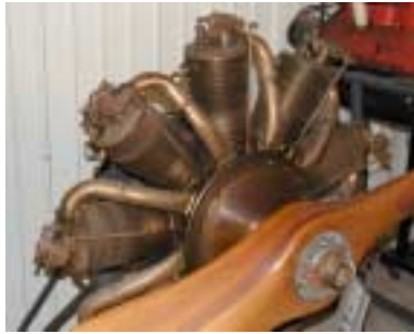
Rotary Engine from a 1929 aircraft

me...glad the press doesn't do this anymore!