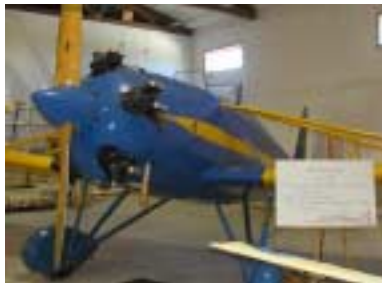
One of 6 WWII Trainers, last one in existence.