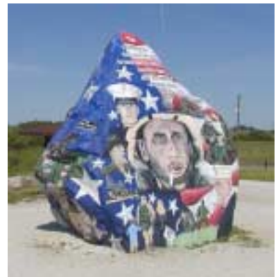
Memorial Rock near Greenfield updated each year by a local artist.