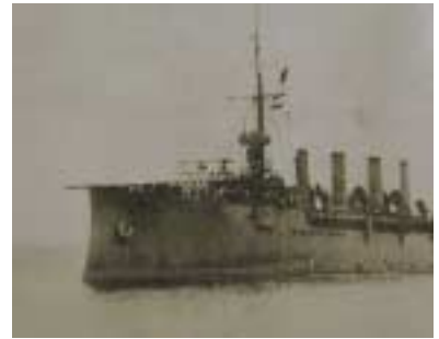
Picture of the first flight from a ship...local Iowa flyer Eugene Ely who died months after this pic doing stunts