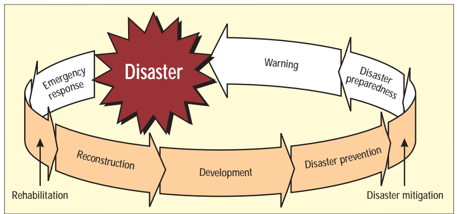
Figure 1: Circular model of disaster

One approach to disaster process modeling which takes these points into account is to use a two-dimensional Cartesian plane. On this 'phase plane,' the 'x' and 'y'